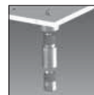
Available as optional KITLEGSSOCKET